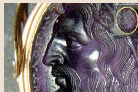
Above: Amethyst engraved with image of Neptune. 19th century