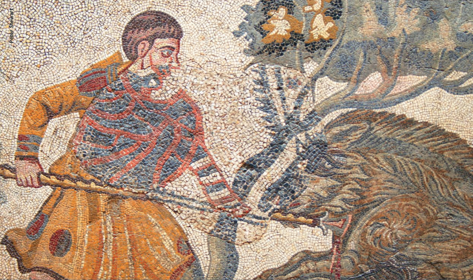
Above: Detail of a Roman mosaic of a hunt. 4th century AD with ancient repairs. Mérida, Museo Nacional de Arte Romana

Based in the heart of Oxford University next to the famous Ashmolean Museum, the Classical Art Research Centre is dedicated to supporting, stimulating and generating excellent and transformative research on ancient art.