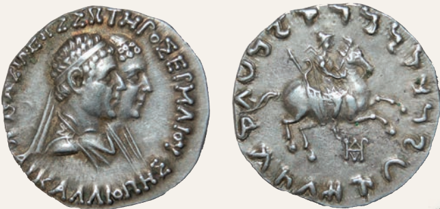
Above: 'Indo-Greek' coin of Hermaios, with inscriptions in Greek and kharosthi script. 1st century BC.

“Your Oxford project on Gandhara leads in an important new direction – and helps me to feel less isolated.” (Artist, India)