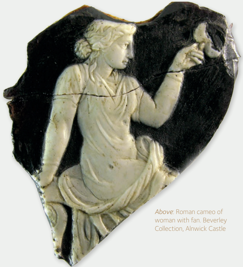
Above: Roman cameo of woman with fan. Beverley Collection, Alnwick Castle

The Centre also publishes work on gems by other scholars through one of our monograph series, Studies in Gems and Jewellery , which is published in association with Archaeopress. Our Gems Database, containing 26,000 records, is a key resource for anyone interested in researching these extraordinary works of art in miniature.