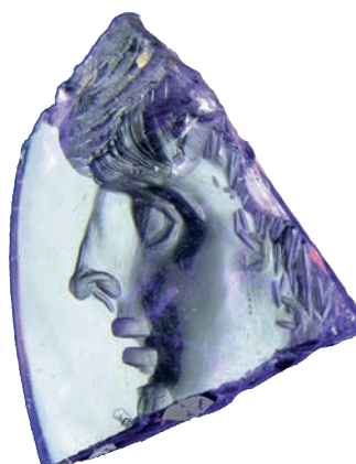
Below: Hellenistic amethyst fragment. Private collection