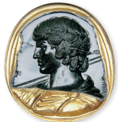
Above: Engraved gem with portrait of Antinous. 2nd century AD. Formerly Marlborough Collection