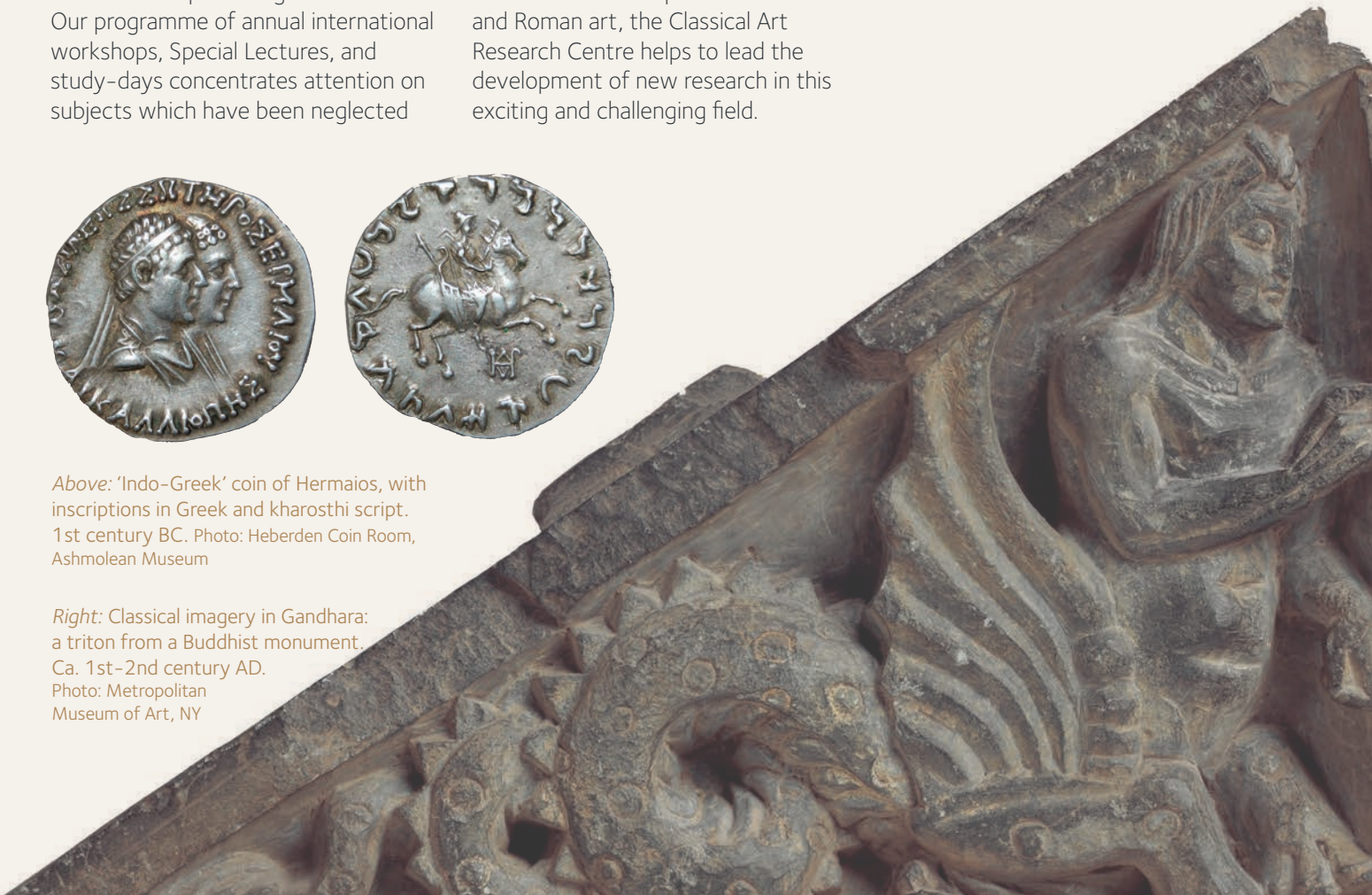
Right: Classical imagery in Gandhara: a triton from a Buddhist monument. Ca. 1st-2nd century AD.