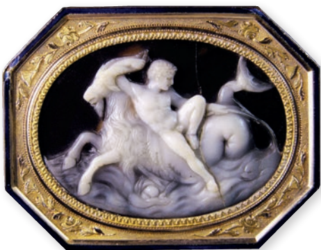
Above: Roman imperial cameo from the Beverley Collection. Man on capricorn: a model for Michelangelo's Adam in the Sistine Chapel?

“We are ... using the Beazley Archive database regularly here for our own research ... and I often refer students and members of the public to it as well if they have any queries relating to vases or gems ... a phenomenally useful resource.” (Museum curator, UK)