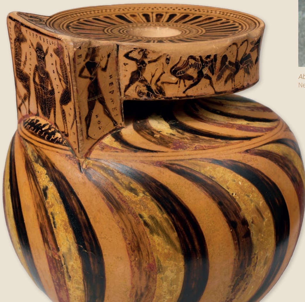
Below: Athenian black-figure aryballos by Nearchos, ca. 570 BC.

website receives about 290,000 visits a year (six million 'pageviews') from virtually every country in the world. Our aim is to sustain and grow our databases and web resources. We will make them ever more effective and accessible in accordance with the most recent standards in 'linked open data'.