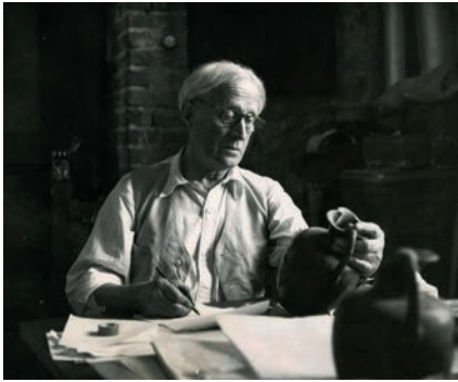
Above: Sir John Beazley studying Greek pottery in Ferrara, 1956

The Beazley Archive, which is at the heart of the Classical Art Research Centre, is the legacy of an extraordinary life's work. Sir John Beazley was Professor of Classical Archaeology and Art at Oxford from 1925 till 1956. Throughout his career he devoted himself to the close study