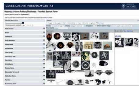
Above: The Beazley Archive Pottery Database

All of our electronic resources are freely available online. The Centre's