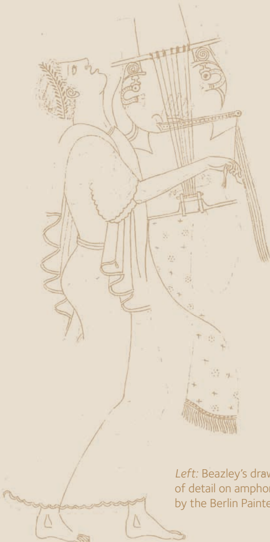
Left: Beazley's drawing of detail on amphora by the Berlin Painter

Our study-room is used by researchers from across the world as well as Oxford faculty and students. It is also a centre for hands-on teaching with ancient Greek pottery.