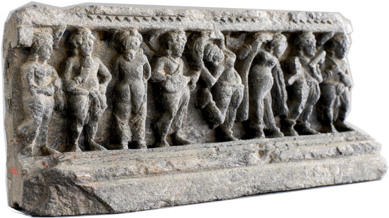
Figure 2. Gandhāran frieze.

Though the piece is much smaller in scale the women have similar hair styles and the third figure from the right is turned away from the audience with her robe draped in a similar fashion. The figures seem much more comparable to the Cleveland piece than any of Kim's examples 7 .