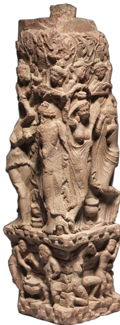
Figure 1. The Cleveland Dancers , described by the Museum as follows: 'Railing Pillar, 100s. India, Mathura, Kushan Period (1st century-320). Red sandstone; overall: h. 80 cm (31 7/16 in). The Cleveland Museum of Art, John L. Severance Fund 1977.34'.